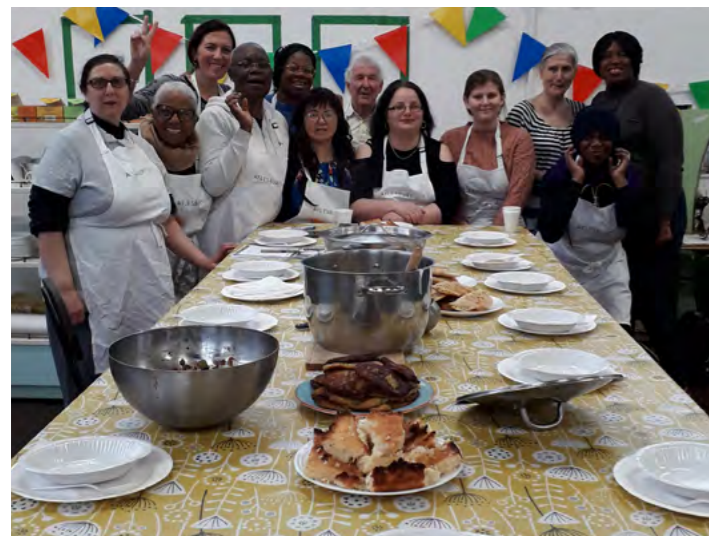
Cooking Club with Aylebury residents

In partnership with Pembroke House and other community partners, we are looking to establish a community kitchen in a disused building on the Aylesbury Estate for groups to run healthy cook and eat sessions. We anticipate that 1350 residents per week will benefit from the food distribution centre, a further 200+ residents would sign up as members to the food pantry and at least 50 residents would access community kitchen and hub activities each week. Visit the Aylesbury Now website to find out more.