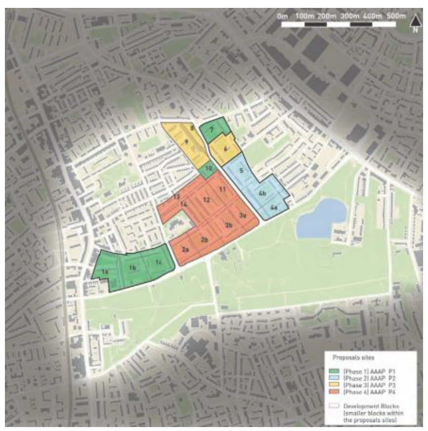
Figure 2.1: AAAP Phases and Sites (see Table 2.4)